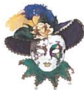
Rene Babin Montreal