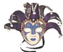
Victor Scaletchi Toronto